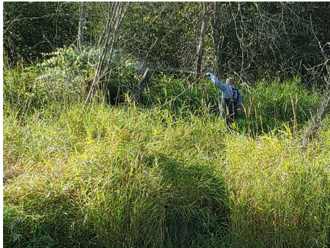
Bohemian Knotweed project on Deep Creek—Boundary County

The Selkirk CWMA new invaders (EDRR) projects in Bonner and Boundary counties included the herbicide treatment of 2.3 acres of Scotch Thistle, .1 acres of Small Bugloss, .2 acres of Leafy Spurge, 6 acres of Scotch Broom, 1 acre of Poison Hemlock, 6.9 acres of large Knotweeds, .5 acres of Phragmites, .5 acres of Yellow Flag Iris and 20.5 acres of Tansy Ragwort. Additionally; about a ½ acre of Scotch Broom was treated using the cut-stump method, and seed heads were clipped/ bagged on 1 acre of 2 nd year Scotch Thistles. This work was performed by county noxious weeds personnel and CWMA partners.