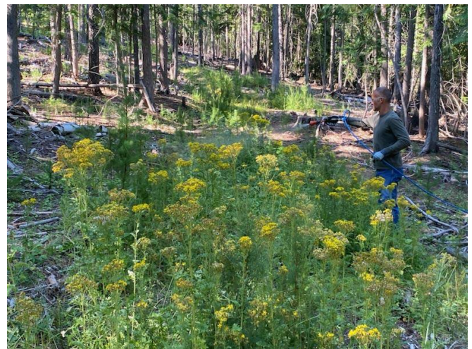
Tansy Ragwort project in Bonner County

Efforts to address EDRR species at the local level is the first priority for the Selkirk CWMA. Diligent efforts are being put forth to eradicate these species overall, but at minimum, to eradicate pioneering colonies. Scotch Thistle, Scotch Broom, Tansy Ragwort and large Knotweeds were the species that received the highest number of acres treated. Small colonies & new infestations of Small Bugloss, Yellow Flag Iris, Leafy Spurge, Poison Hemlock and Phragmites were also treated.